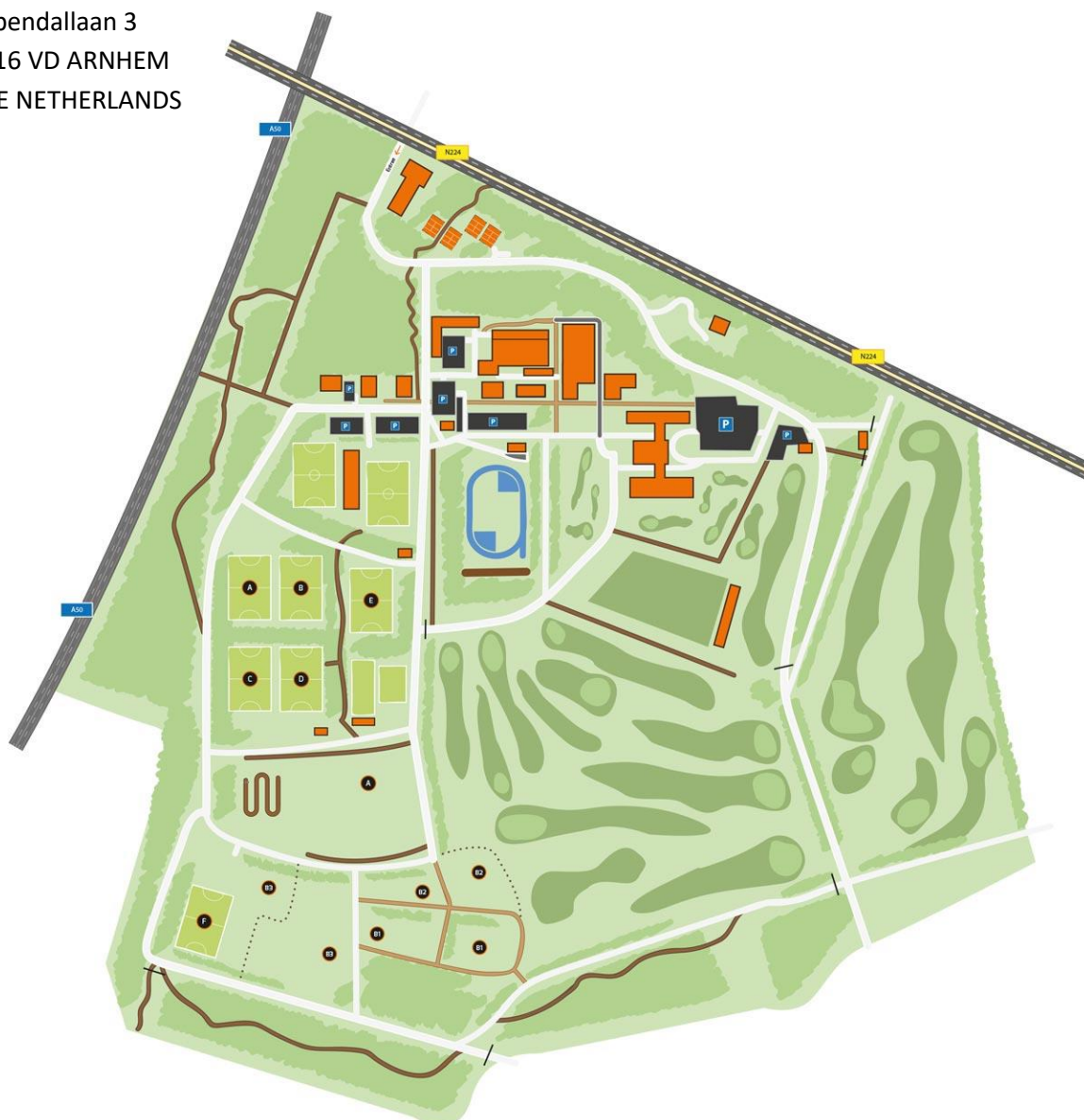
Ground plan Sport Centre Papendal

Papendallaan 3 6816 VD ARNHEM THE NETHERLANDS