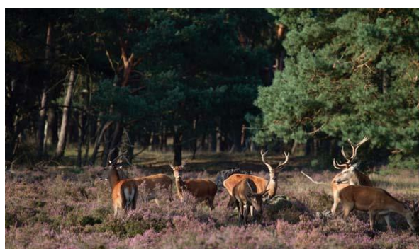
National Park De Hoge Veluwe