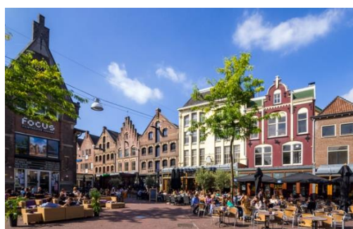
The City of Arnhem