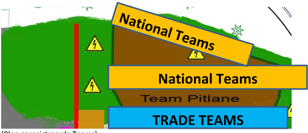
(Plan geregistreerde Teams)

Circuit Zolder account number: 335-0340431-07 IBAN: Be 74 3350 3404 3107 BIC: BBRUBEBB200