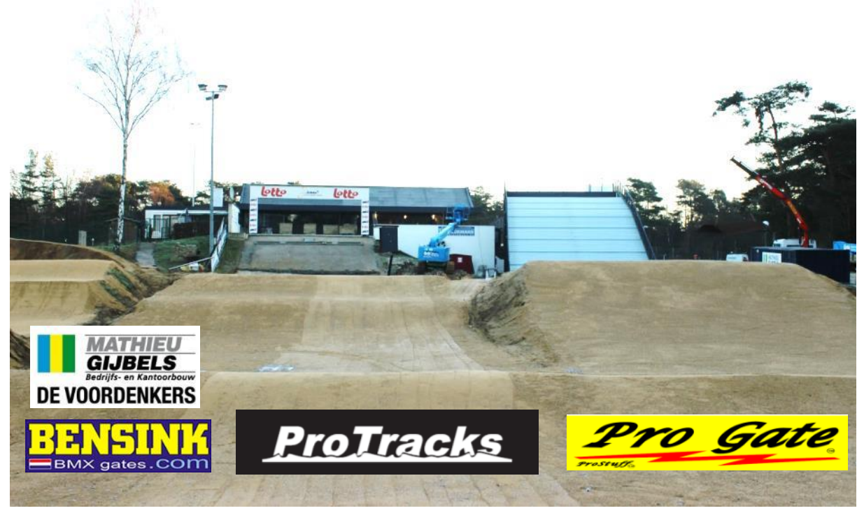
(track 5m/ 8m starting ramp Construction november 2013)

Thus, the UEC BMX European League is the first big test for our renewed BMX-track. This way, Europe's best riders, national coaches and audience get to know the future WC BMX-track 2015.