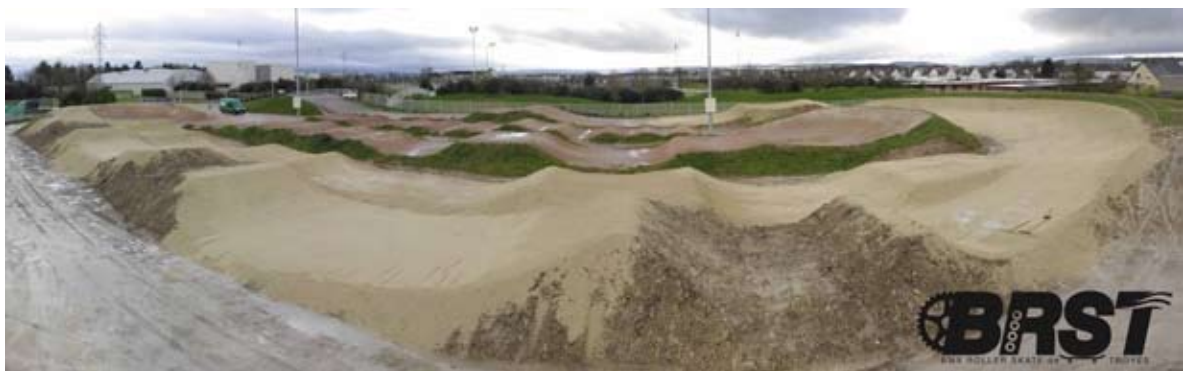
Pro section under construction

Please note that no refunds will be done.